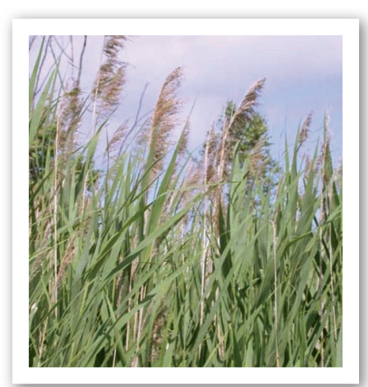
A strand of Phragmites Australis.