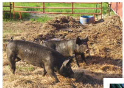
Pigs turn garden waste into delicious pork. They also help make the compost.

Beautiful heirloom vegetables at the Grafton Farmers' Market all grown without chemicals.