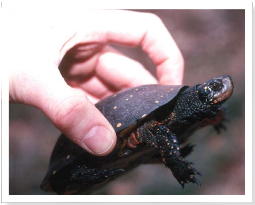
A spotted turtle found in Grafton.

For creatures without fur or feather, winter is a waiting game. To escape the killing freeze they dig down in the cold dark muck that lies beneath Grafton's wetlands and slip into a deep sleep. Faint evidence of life's rhythmic pulse clings tightly to their core as snow blankets the landscape above. There they lie, motionless, to be awoken only by the gradual warming of spring. One such creature well adapted to survive New England's long winters in this manner is the spotted turtle (Clemmys guttata).