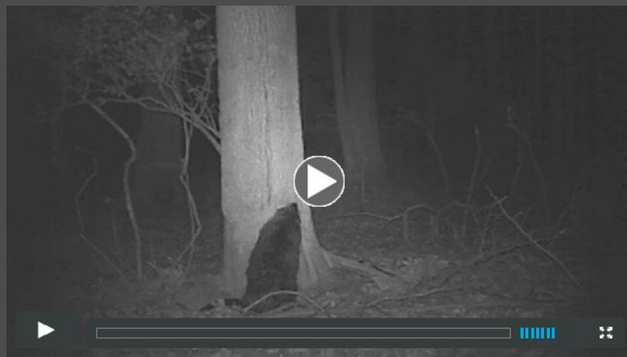
Trailcam video by Troy Gipps