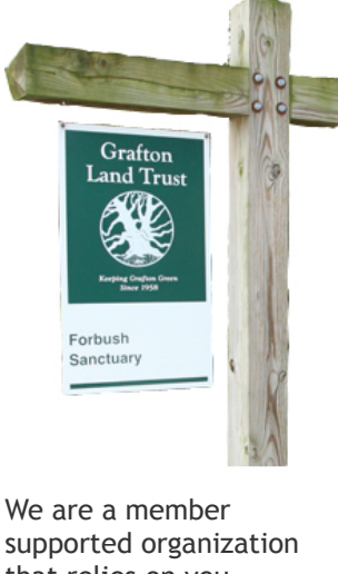
that relies on you hunters - as well as hikers, equestrians and other recreational users to manage our lands. Please become a member today!

Grafton Land Trust hunting@graftonland.org